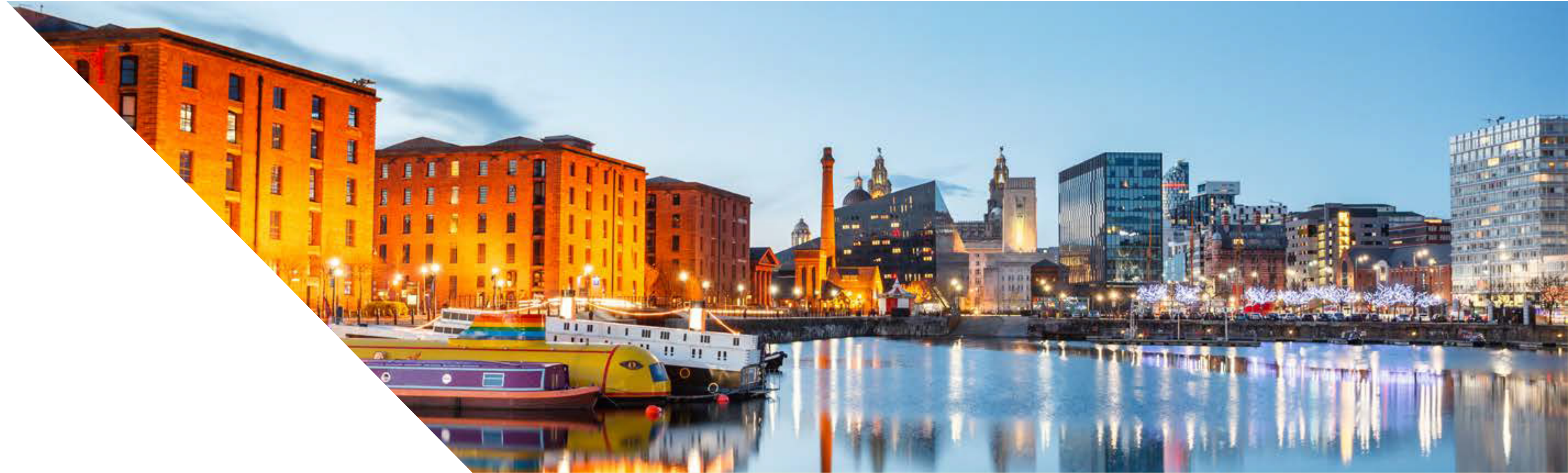
ROYAL ALBERT DOCK & LIVERPOOL WATERFRONT