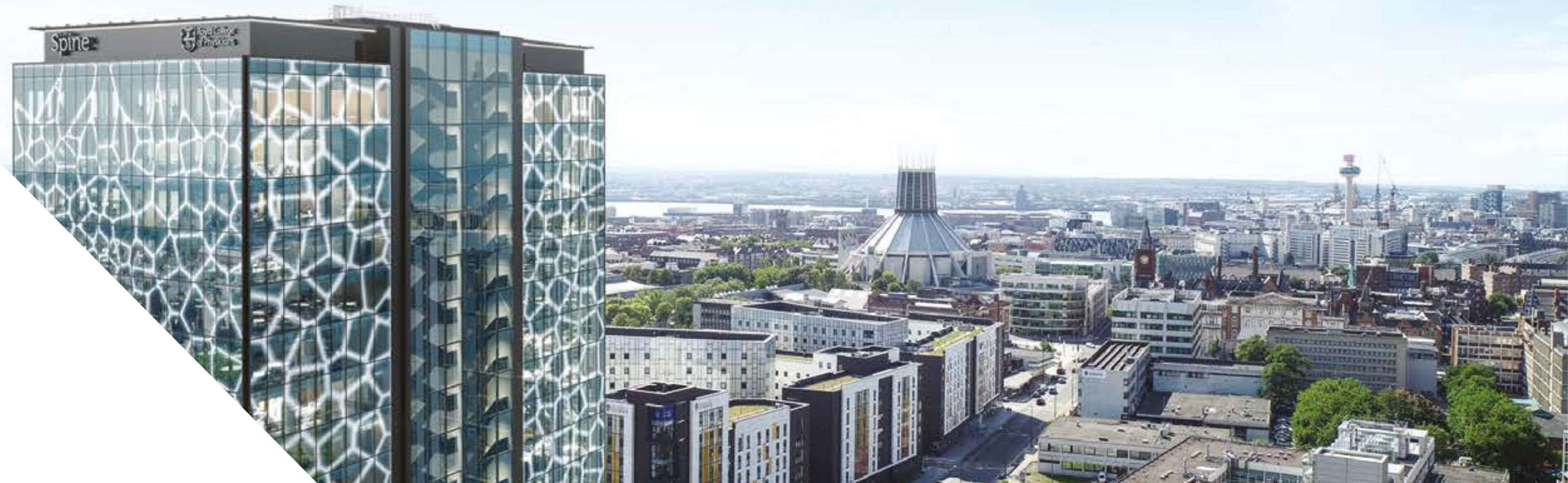
KNOWLEDGE QUARTER, LIVERPOOL

Expanding in Liverpool City Region will place you at the heart of a world-class ecosystem of expertise, ground-breaking R&D, clinical resources and public-private collaboration in Health & Life Sciences.